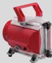
MVP 030-3 DC