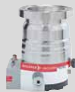
HiPace 300 H