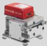
MVP 015-2 DC